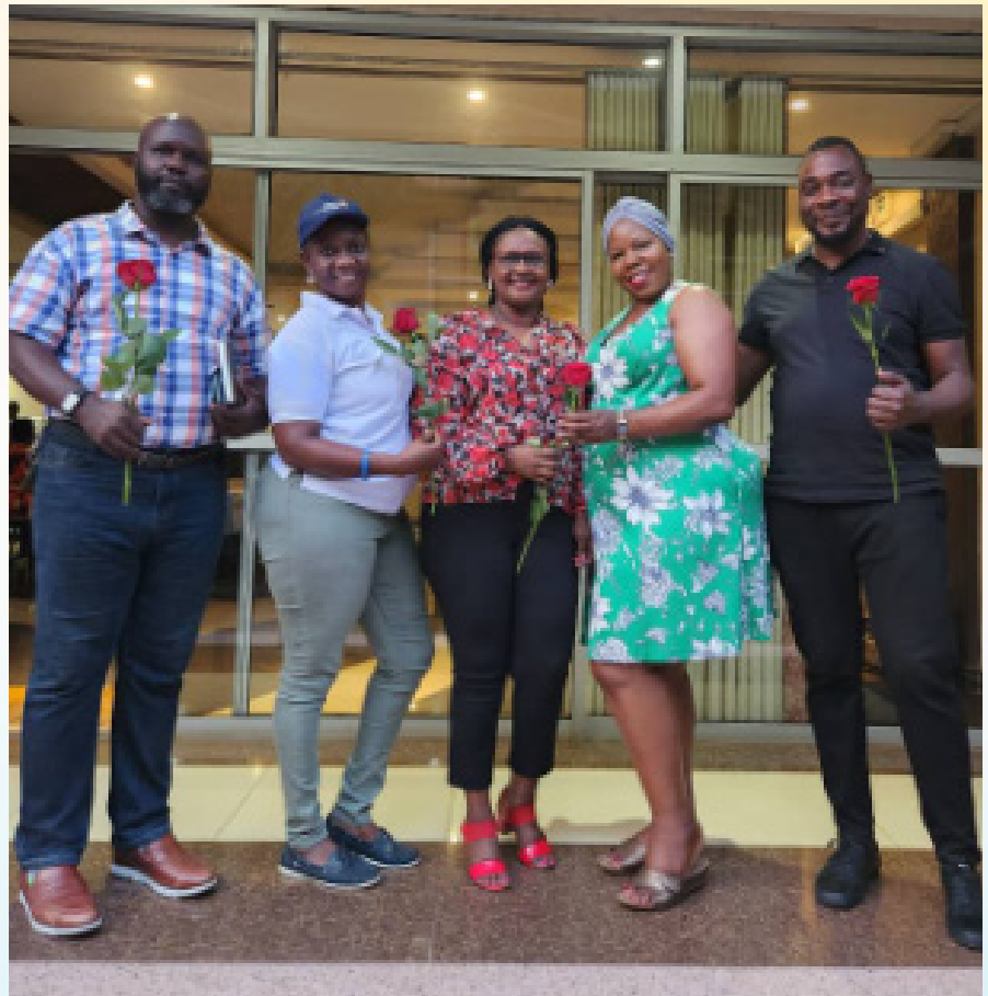
February is a month of love: RC-Nalumunye members took time to celebrate love.