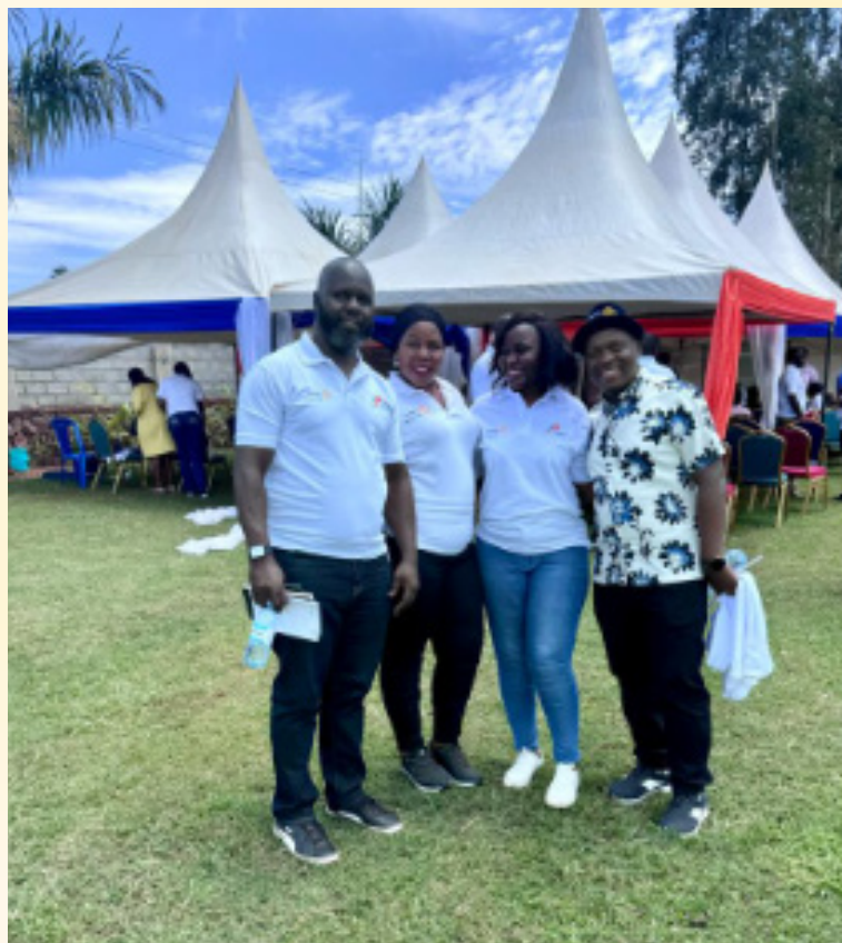
Members of RC Nalumunye at the Entebbe Road corridor PETS training