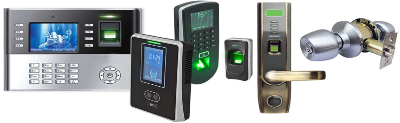
Access control systems