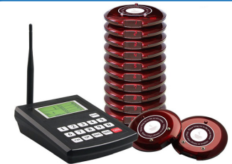
Single fast food Restaurant Paging Systems