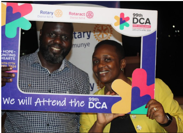
PE and PN confirm attendance of 99th District (DCA-2024)