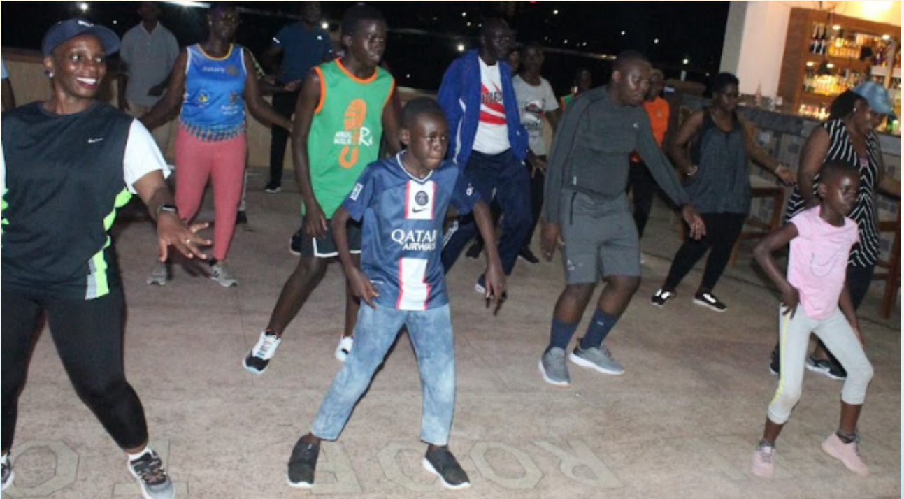
Rc Nalumunye held Zumba Fellowship on 29th November 2023