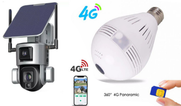
Solar SIM Card PTZ Cameras & SIM Card Wifi Bulb Cameras