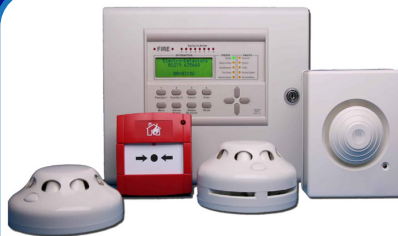
Fire Alarm Systems