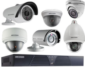
Surveillance CCTV Systems