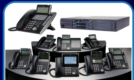
PABX & Intercom Systems