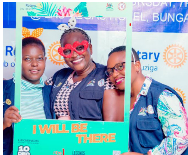
RC Nalumunye PN represents at all Thursday clubs' fellowship