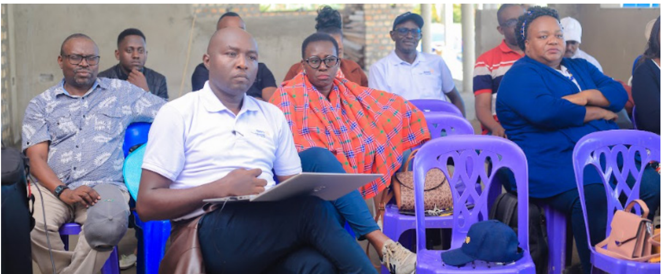
Retreat in progress and evaluation on going at White Sand beach-Bunjako