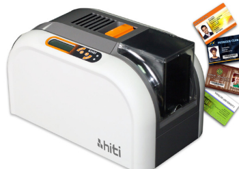
Plastic ID Card Printers