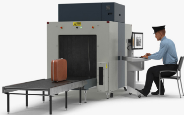
Baggage Scanning Systems