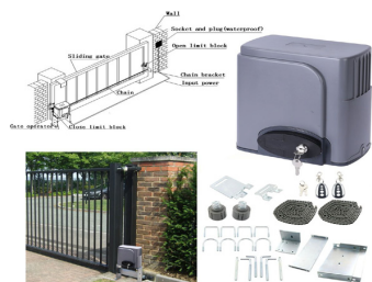
Automatic Opener for Sliding Gate