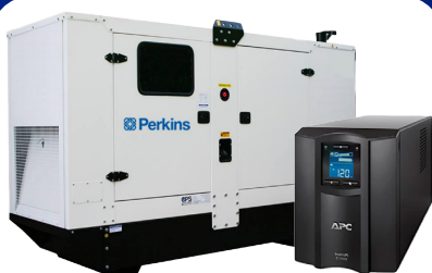
UPS & Standby power Systems