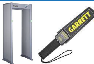
Walk Through Metal Detector & Hand held metal detector