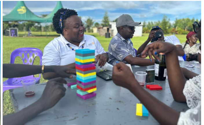
Some of the games during the Bunjako Beach retreat last October 2023