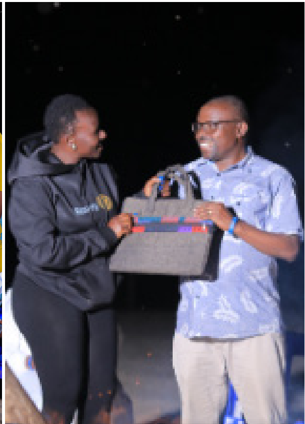
Giftng of the Friends of the year by some of the Rc-Nalumunye Rotarians