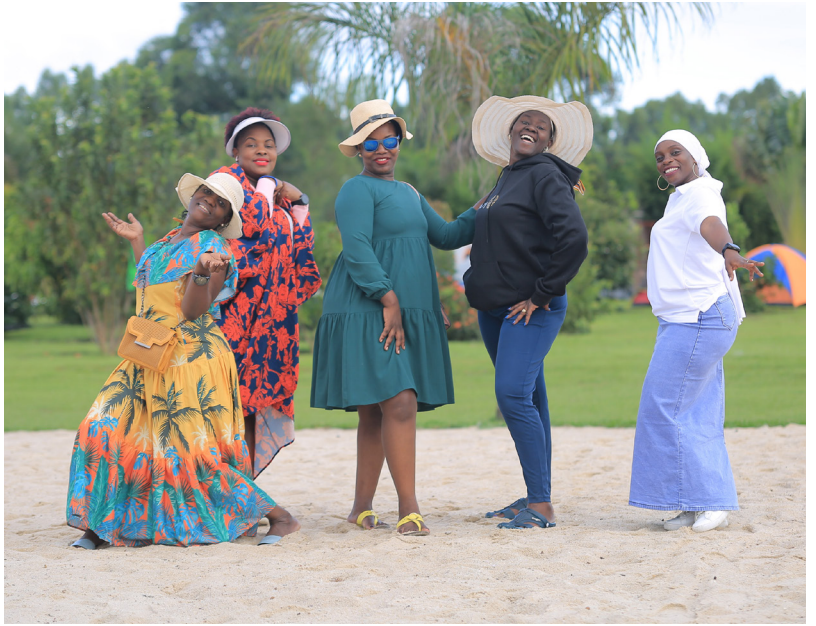
Ladies wing at White Sand beach-Bunjako