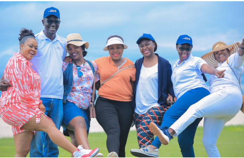
Some fun moments-Let us do it- White Sand beach-Bunjako moments