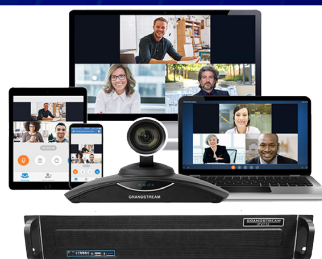
Video Conference Systems