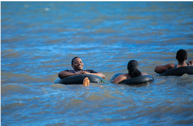
Just relax: Let us Swim at White Sand beach-Bunjako